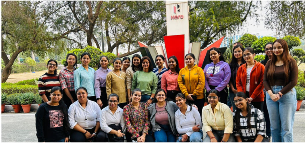
Hero Moto Corp, Dharuhera Plant