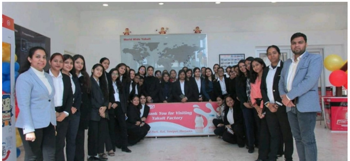
Yakult, Danone India Pvt Ltd