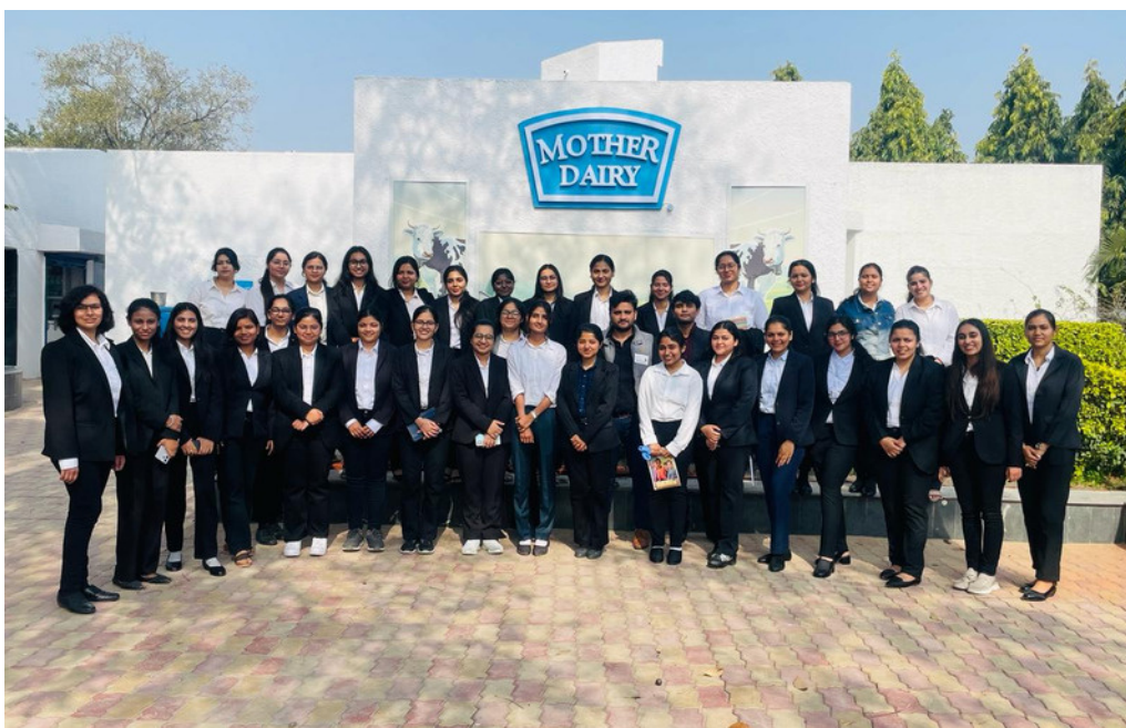
Mother Dairy Plant, Patparganj, Delhi