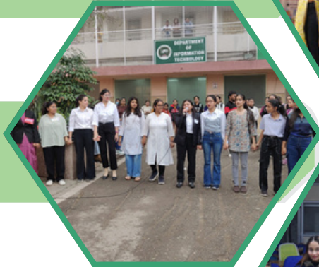
Visit to Partition Museum