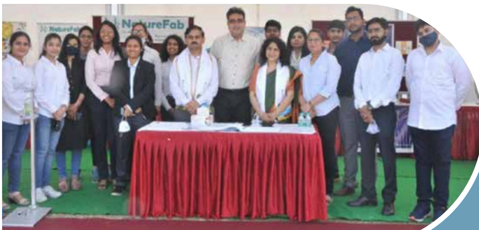
Incubatees and Team of Anveshan Foundation

Many of these incubatee companies are provided seed fund of up to INR 10 lakhs.