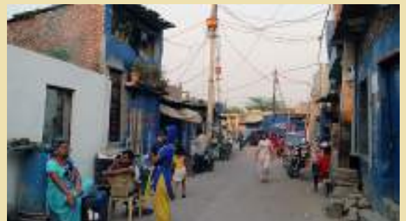
UNPLANNED CONSTRUCTION HAS LED TO MANY ABANDONED HOUSES AND OVERCROWDED STREETS IN THE VILLAGE.

" Much of India that we dream of still lies ahead of us: housing, power, water and sanitation for all; bank accounts and insurance for every citizen; connected and prosperous villages; and, smart and sustainable cities. "