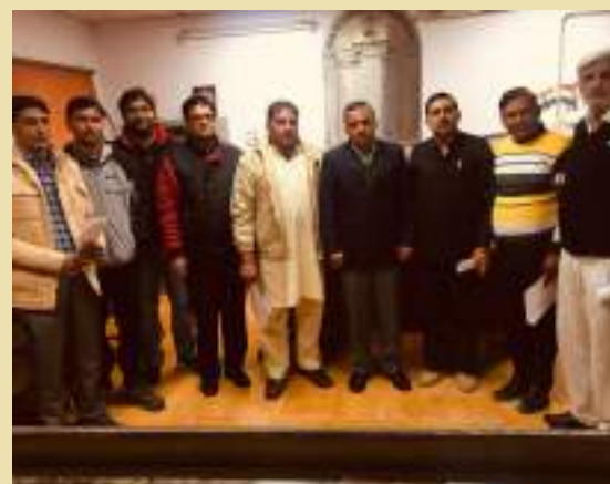
Image: The Meeting of faculty incharge UBA cell with SDM, Seelampur.