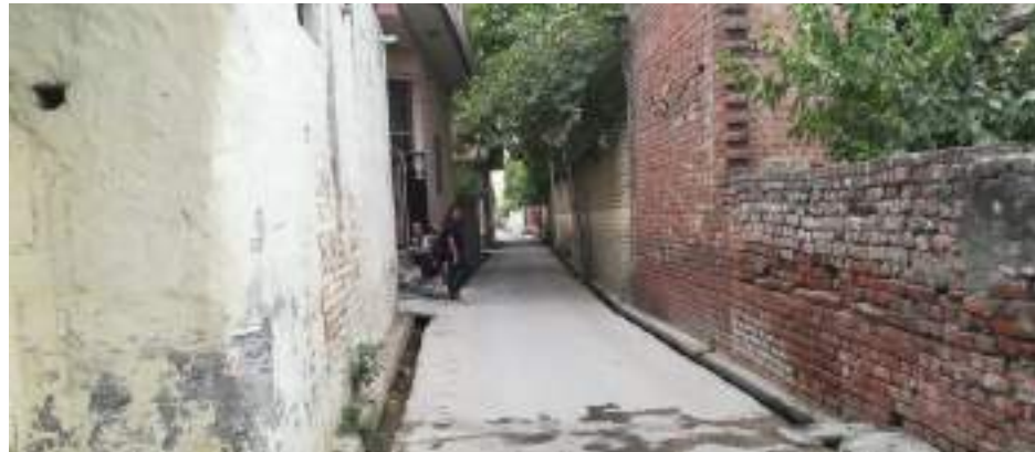
Image: The unplanned and uncontrolled growth of urban village has results in uneven and narrow road with open drains

Currently, with about 135 urban villages, Delhi has more than 16.5 million people living in these urban villages. However, the unplanned and unrestricted boom of residential and commercial establishments in the absence of basic amenities has attracted no authority's attention beyond promises.