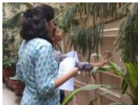
Image: Conduction of survey in the streets of Burari