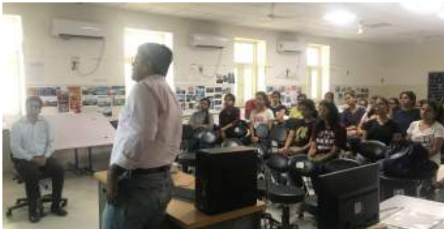
Image: 4th June 2019, conduction of introductory meeting for university students of IGDTUW by UBA Cell faculty members

Over 70 students had shown their interest for participation in UBA till 04.06.2019.