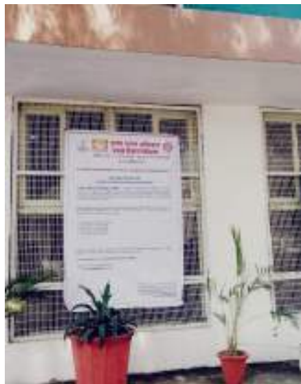
Image: Installation of UBA Banners