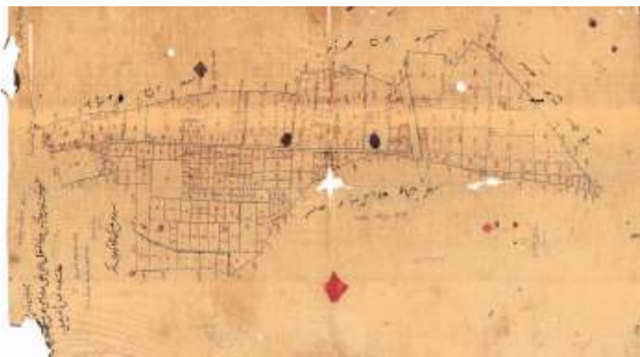
Image: The 'Khasra Map' of Seelampur made in 1970-80 retrieved from Tehsildar of Seelampur