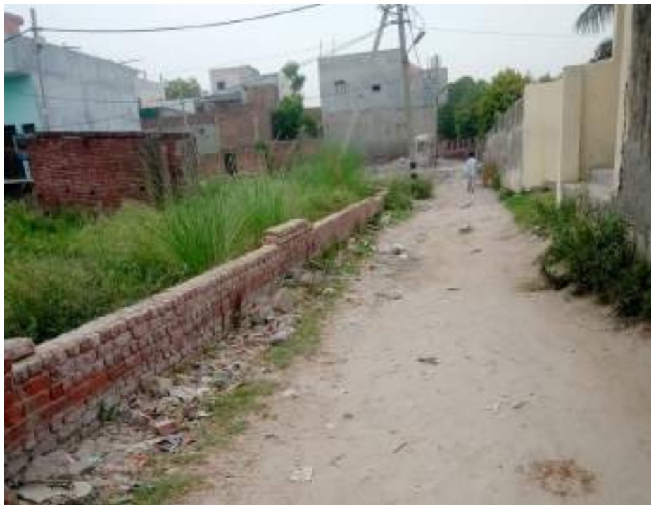
Image: With no official body looking over the development of the Lal Dora area, the lacks many basic amenities.

The capital city of Delhi has the unique land division where it has urban as well as rural areas within its boundary, itself being a metropolitan. The so-called urban villages of Delhi came into existence in 1908, when the capital of India was shifted to Delhi. Since technology had no play in planning then, the officials used to use a red thread to demarcate the non-agricultural land from agricultural land. On map as well these areas were demarcated by a red line and thereby popularly came to be known as 'Lal Dora' area. The municipal bodies had no jurisdiction over these areas and therefore these areas became an attraction for people that wanted to construct affordable big-independent houses. Due to the absence of laws, many illegal constructions have come up in this area.