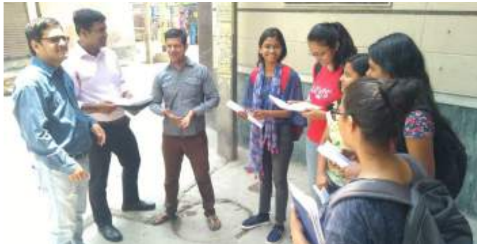
Image: Discussion between UBA Faculty coordinators, Local Residents and students during Household surveys.