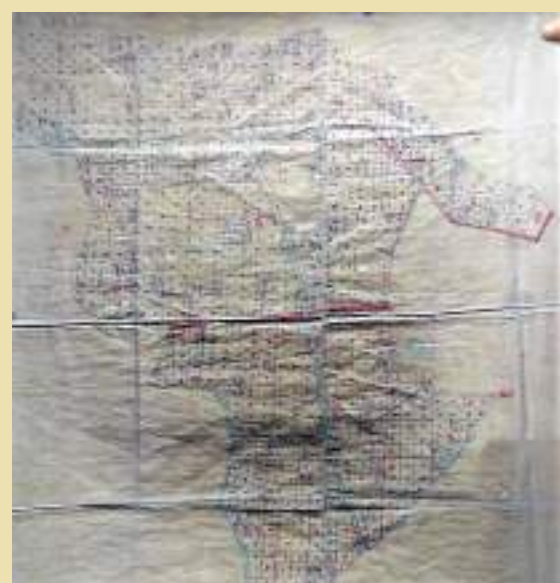
Image: The 'Khasra Map' of Burari made in 1970-80 retrieved from SDM Burari