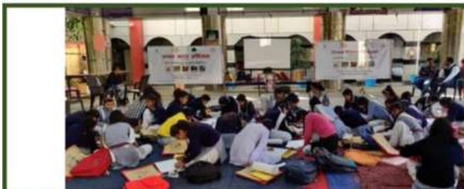
Caption: A WILL FOR A BETTER TOMORROW As students today are leaders tomorrow, Seeds of compassion when sown, inspire awareness anew

A painting competition on ‘save water’ was conducted in the rural part of the city of New Delhi. This was conducted by the Department of Architecture and Planning to educate those areas and sensitize them towards the need of basic amenities and to strive for a better tomorrow.