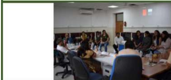
Caption: KNOWLEDGE IS REVIVED Boundless knowledge from all visionaries finally imparted , students from the University deliberated, ideated and formulated effective responses .