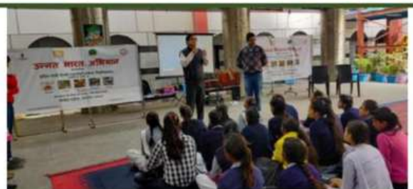
Caption: WHEN FAITH STRENGTHENS UBA Pioneer programme for the rural fabric that’s everchanging, brought to fruition with sweet symphony involving community.