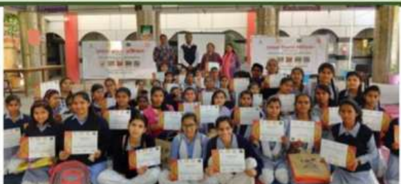
Caption: A HOPE FULFILLED We strive for a utopic tomorrow, These countless bright faces are proof, Of this essence shining through

“The function of education is to teach one to think intensively and to think critically. Intelligence plus character – that is the goal of true education”